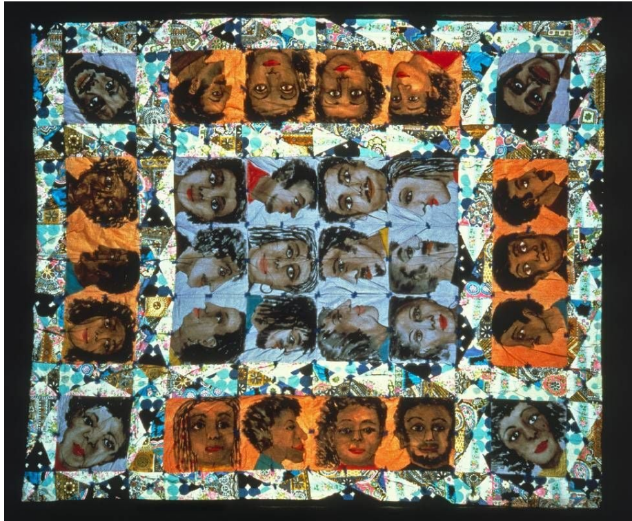
Faith Ringgold, Echoes of Harlem, 1980